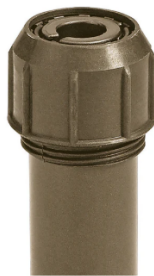
FBW84 (Bronze) Wheels & Stem