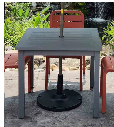
TUB35 (Black) Base