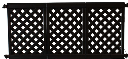
3 Panel Section