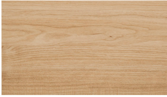
NATURAL MAPLE (23)

**Natural Maple is an accent color only and a Headboard color option only