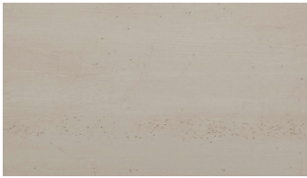
WEATHERED WHITE (03)