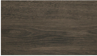
RODEO OAK (20)