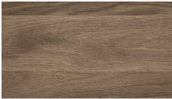
SALT OAK (19)