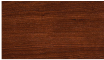
TRADITIONS CHERRY (02)