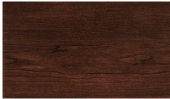
COLONIAL CHERRY (40)