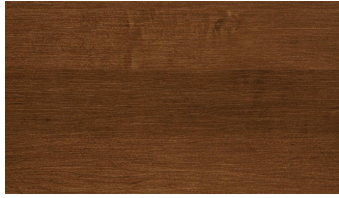
FARM MAPLE (22)